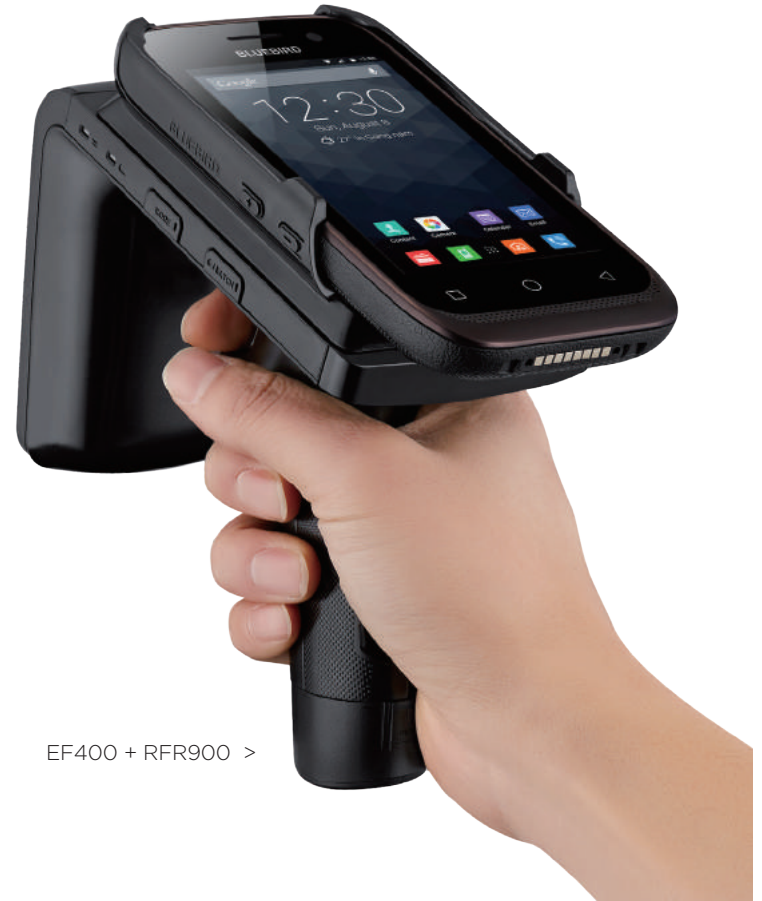
EF400 + RFR900 >

A 13.0 megapixel camera with autofocus optimizes industrial imaging solution and performance speed. We provide just what our customers need.